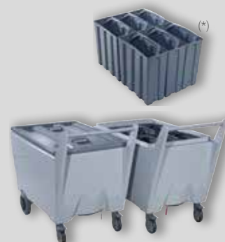
EASY CART KIT 6 CESTAS