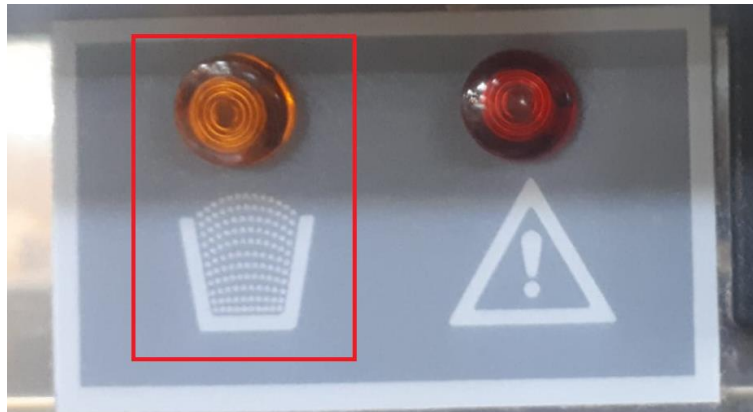
Foto: Este icono encendido indica llenado de stock.

If the machine is showing on the display that it is full, but the tank is empty, we should check the stock thermostat.