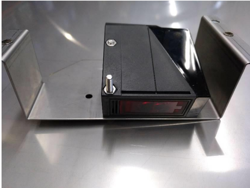
Photocell on its support