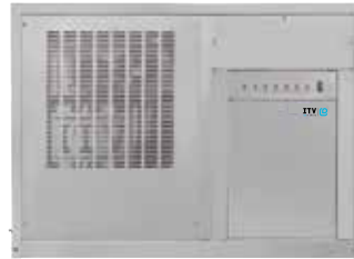
SCALA 400 / SC 600 Case