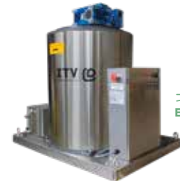
SC SPLIT CO2