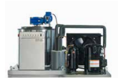
SCALA 1TN / 1,5TN / 2TN / 3TN / 5TN / 10TN